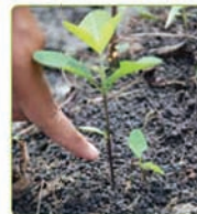
Batang keunguan saat baru tumbuh

Mallika merupakan varietas kedelai hitam unggul nasional terbaru yang ditemukan oleh para peneliti dari Fakultas Pertanian UGM. Varietas lokal ini dikembangkan melalui proses pemurnian dengan sistem galur, bukan persilangan dan bebas rekayasa genetik. Kedelai ini dilepas berdasarkan SK Menteri